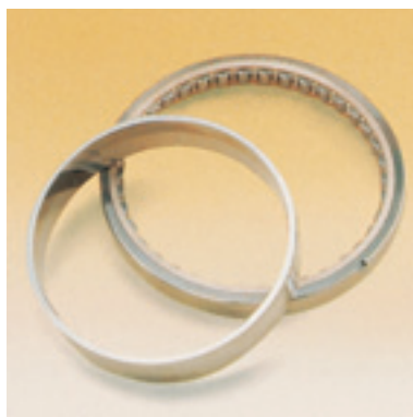
Main shaft bearing

J79-17 (F-4EJ), J805 (T-1A), T53-13B (UH-1H), T53-703 (AH-IS), T55 (CH-47), T56 (P-3C), T58 (KV-107, HSS-2), T63 (OH-6J), T64 (US-1), JT8D-9 (C-1), TF40 (F-1, T-2), F100 (F-15J), T700(SH/UH-60J)