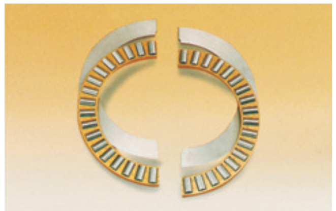
Propeller shank bearings

Major propellers in which NTN bearings are employed 63E60 (HAMILTON STANDARD LICENCE) 54H60 (HAMILTON STANDARD LICENCE)