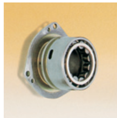
Reduction gear bearing