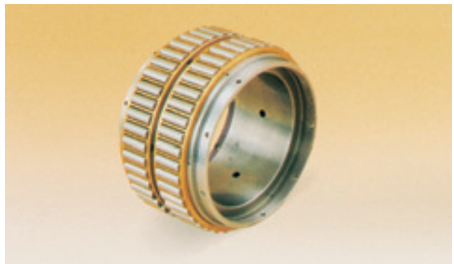
Reduction gear bearing