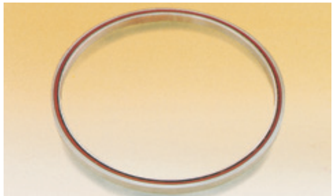
Swash plate bearing