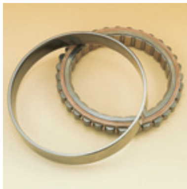
Main shaft bearing

RJ500 (Joint Development of Japan and England), V2500 (Joint Development of Japan, USA, England, Germany, and Italy)