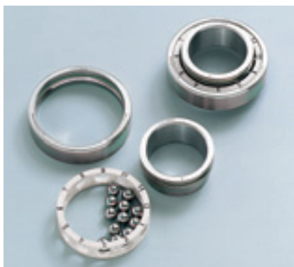
Liquid Hydrogen Turbo Pump Bearings