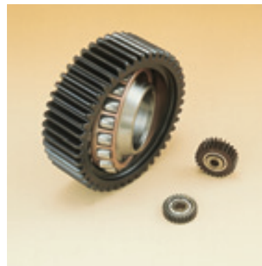
Reduction gear bearing