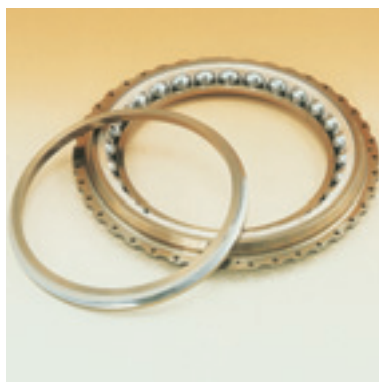
Main shaft bearing

J3 (T-1B, P-2J), JR100 (Trial Manufacture), FJR710/10 (The First Trial Manufacture of STOL), FJR710/20 (The Second Trial Manufacture of STOL), FJR710/600 (ASUKA), F3 (T-4)