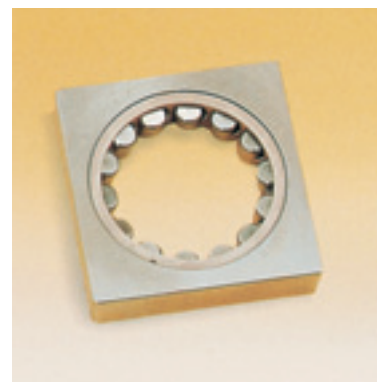
Reduction gear bearing